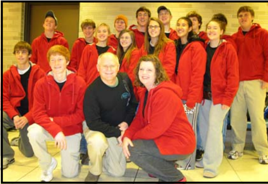
Korea Mission Team 2009

FaithHeritage Christian Academy has as its philosophical foundation the infallible Word of God. The goal of all education, according to 1 Corinthians 10:31 “ Whether therefore ye eat, or drink, or whatsoever ye do, do all to the glory of God. ”, is to help man achieve life’s purpose: to glorify God. As the explicit revelation of this God, whom men are to know and serve, the Word of God provides the primary instrument toward the goal of education. In light of this, emphasis must be placed on learning, understanding, applying, and memorizing the Scriptures during the school day.